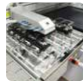
substrate loading from conveyor and unloading by adjustable suction cups

- total system accuracy: \pm 10 \mu\text{m} / \pm 0.4 \text{ mil}