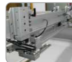
dripless squeegee unit