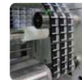
EPC guide web rolling alignment Air shaft to hold firmly the material roll Servo motor with load-cell to control web tension

Note : RR2550/C & RR3250/C with CCD - camera - registration and auto - alignment RR5060/S with sensor - registration and auto - alignment