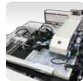
handling and printing of thin film substrates: feeding from pile and unloading by adjustable suction cups

- total system accuracy: \pm 10 \mu\text{m} / \pm 0.4 \text{ mil}